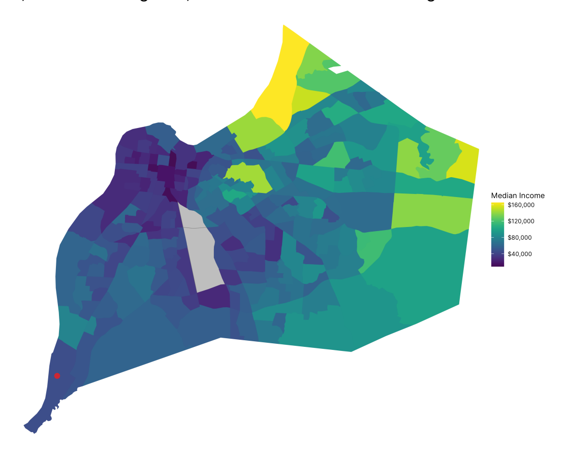
Figure 1 - Location of Mill Creek compared to median income in Louisville21

In the instant case, the Mill Creek facility is in an area that is considered "disadvantaged" by the White House Council on Environmental Quality (CEQ).<sup>20</sup> Specifically, the tract already has a low life expectancy in the 94<sup>th</sup> percentile. In addition, as shown in Figure 1, the tract has well below average median income.