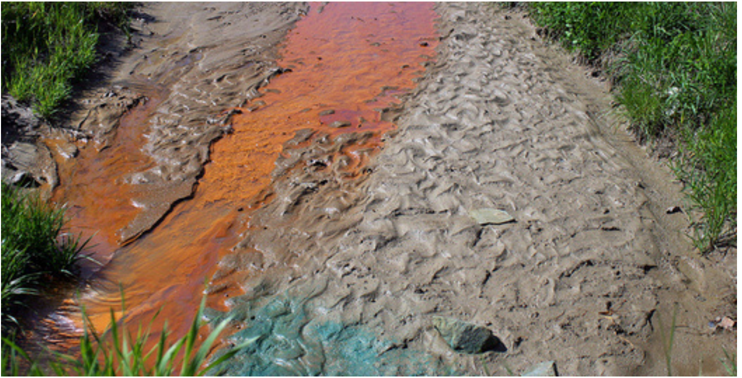
WE ALL LIVE DOWNSTREAM: A polluted stream flows downhill from a mountaintop removal mine in Magoffin, County.