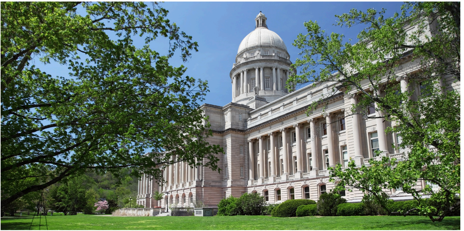
STANDING STRONG IN FRANKFORT: The Kentucky Capitol in summer.

E ach year, the Kentucky General Assembly considers hundreds of bills that shape our environment, economy, and communities – sometimes for the better, often for the worse.