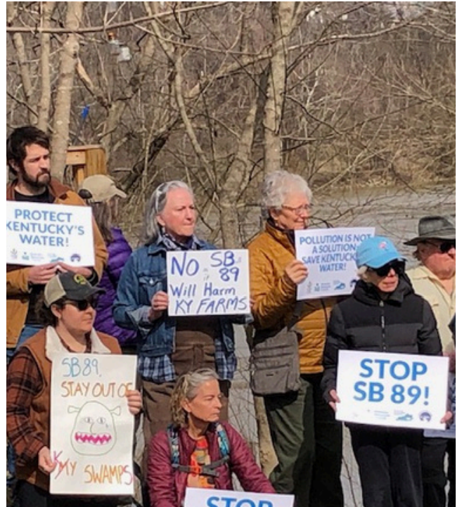
COMING TOGETHER (ABOVE): Environmentalists, experts, and concerned citizens attended a rally in Frankfort in opposition of SB 89.

Though SB 89 became law, it sparked momentum and brought people together. This fight reaffirmed the power of a united community demanding a cleaner environment. The road is long — but together, we’ll keep up the fight for a healthier Kentucky.